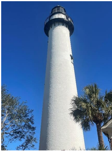
Repaired Lighthouse Tower

The Lighthouse and Keeper's Dwelling are rejuvenated after the completion of exterior maintenance projects in March 2025. Razorback LLC prepared and painted the Lighthouse observation deck and handrail, as well as the lantern room deck and exterior handrail, in addition to washing, repairing, and painting the exterior masonry. Coastal Coverage Painting & Design Inc. painted the Keeper's Dwelling porch and benches, windows, shutters, soffits, and corbels. In addition to a refreshed aesthetic, repairing and painting helps protect these buildings from the harmful effects of our coastal weather. This kind of work is made possible through the Preservation Fund, which ensures that our beloved historic structures are preserved for future generations.