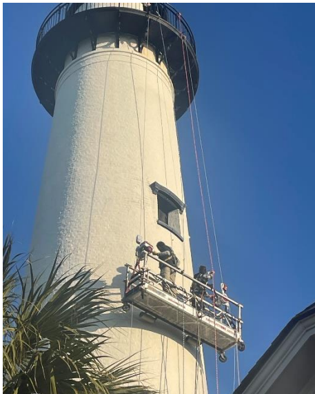
Workers suspended from the tower during repairs.

The Lighthouse and Keeper's Dwelling are rejuvenated after the completion of exterior maintenance projects in March 2025. Razorback LLC prepared and painted the Lighthouse observation deck and handrail, as well as the lantern room deck and exterior handrail, in addition to washing, repairing, and painting the exterior masonry. Coastal Coverage Painting & Design Inc. painted the Keeper's Dwelling porch and benches, windows, shutters, soffits, and corbels. In addition to a refreshed aesthetic, repairing and painting helps protect these buildings from the harmful effects of our coastal weather. This kind of work is made possible through the Preservation Fund, which ensures that our beloved historic structures are preserved for future generations.