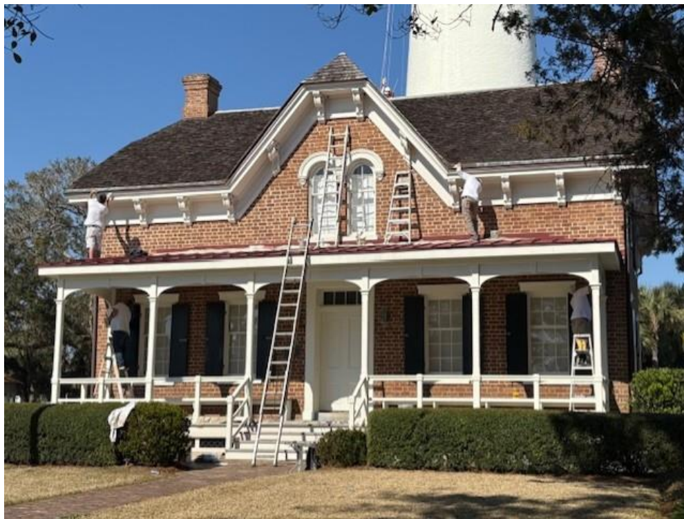
Keepers Dwelling during painting.