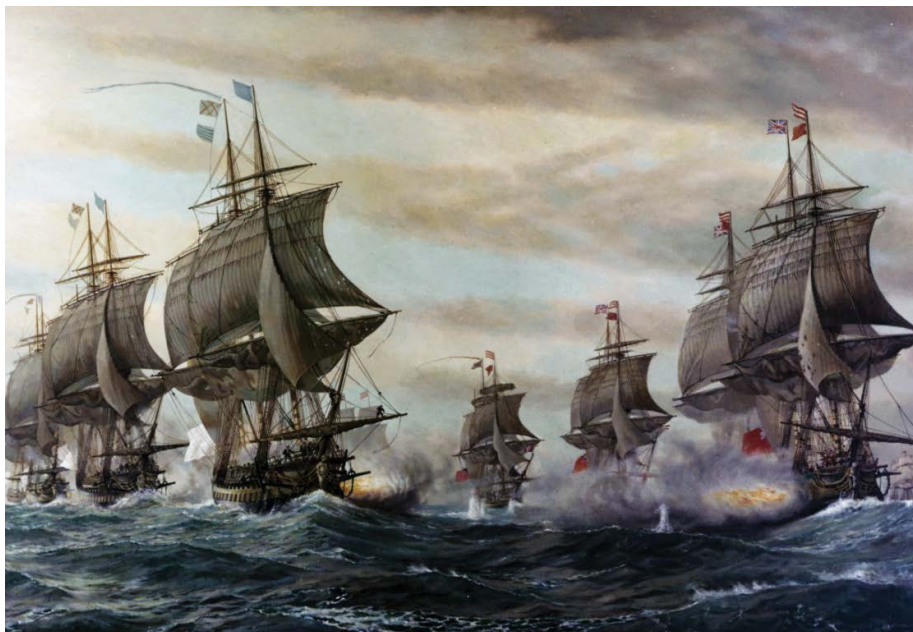
Battle of the Virginia Capes, 5 September 1781

The Coastal Georgia Historical Society's Winter Program will set the stage for the U.S. Semiquincentennial celebration in 2026 by featuring award-winning author Nathaniel Philbrick on Sunday, January 26, 2025 at 4 p.m. He will discuss his book In the Hurricane's Eye: The Genius of George Washington and the Victory at Yorktown , with a focus on Nathanael Greene, a major-general in the Continental Army with significant ties to Coastal Georgia. Washington named Greene the commander of the Continental Army in the southern theater, where Greene's campaign against Cornwallis contributed to the successful outcome of the war. Philbrick will weave together the crucial events of the Revolution's final years and bring to life the fascinating personalities who fought on land and sea for the ultimate prize of American independence.