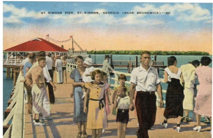
Postcard of St. Simons Island Pier, ca. 1930s

The cost for the series is $50 for CGHS members and $95 for non-members. Registration is required at coastalgeorgiahistory.org .