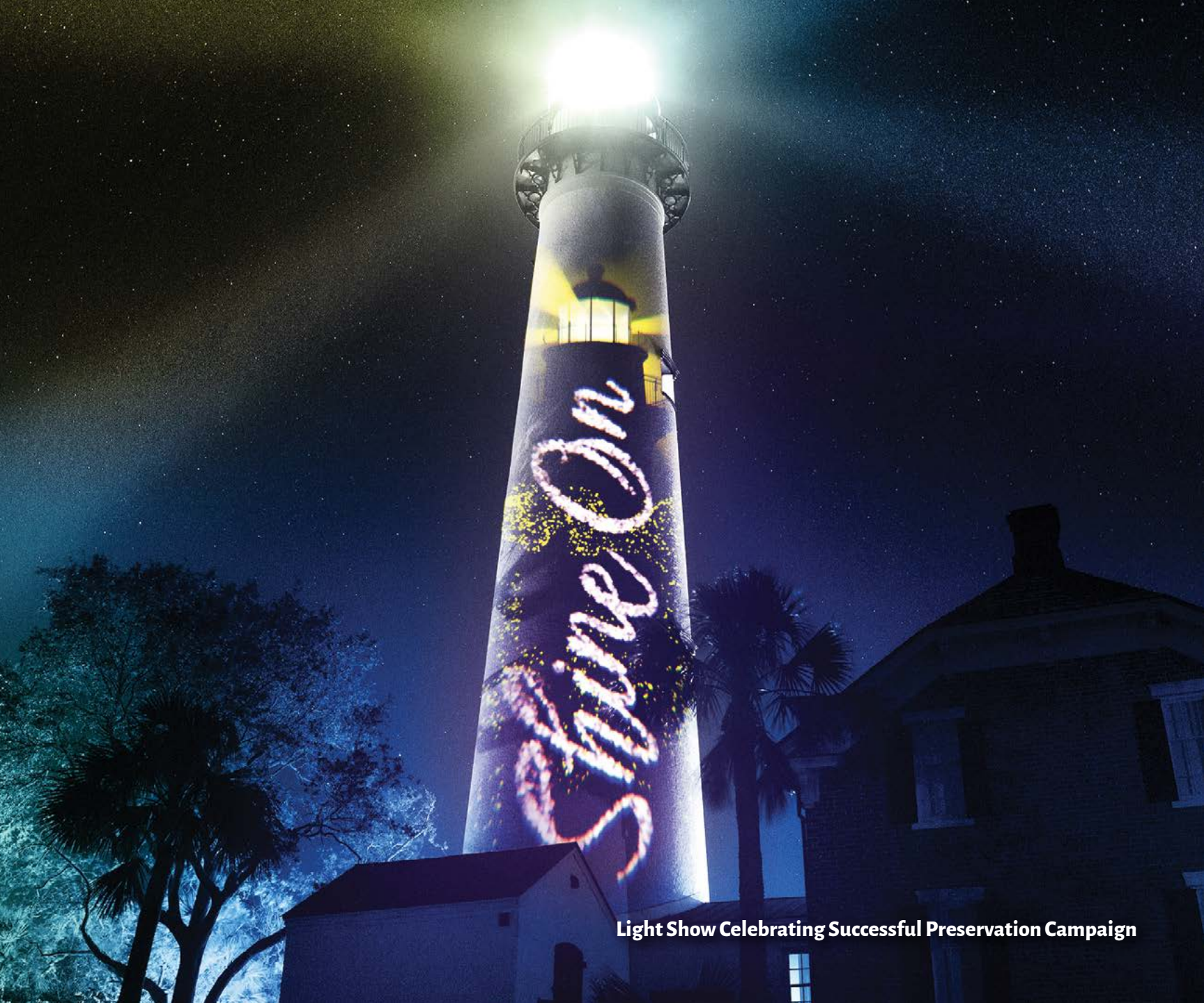
Light Show Celebrating Successful Preservation Campaign