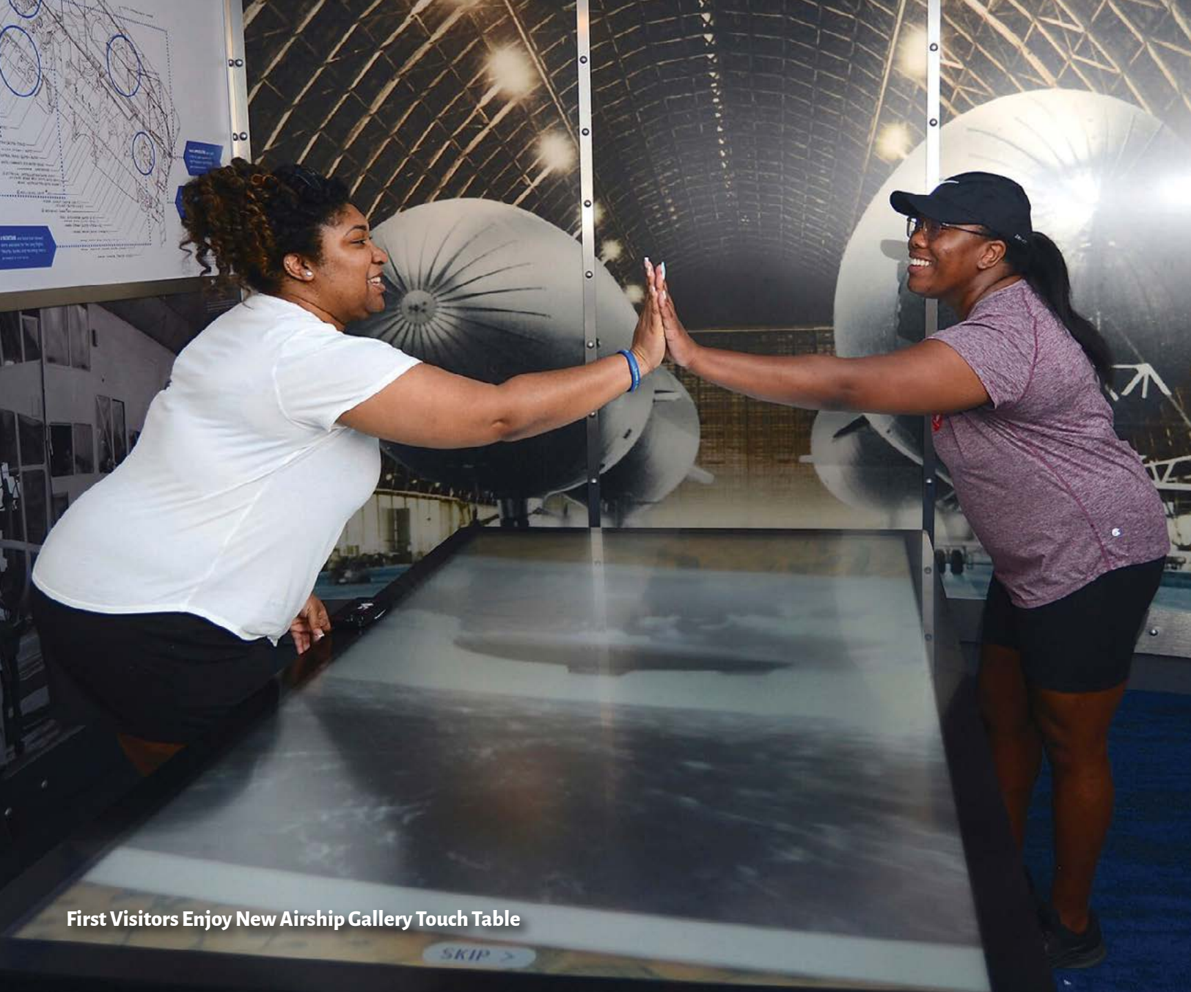
First Visitors Enjoy New Airship Gallery Touch Table