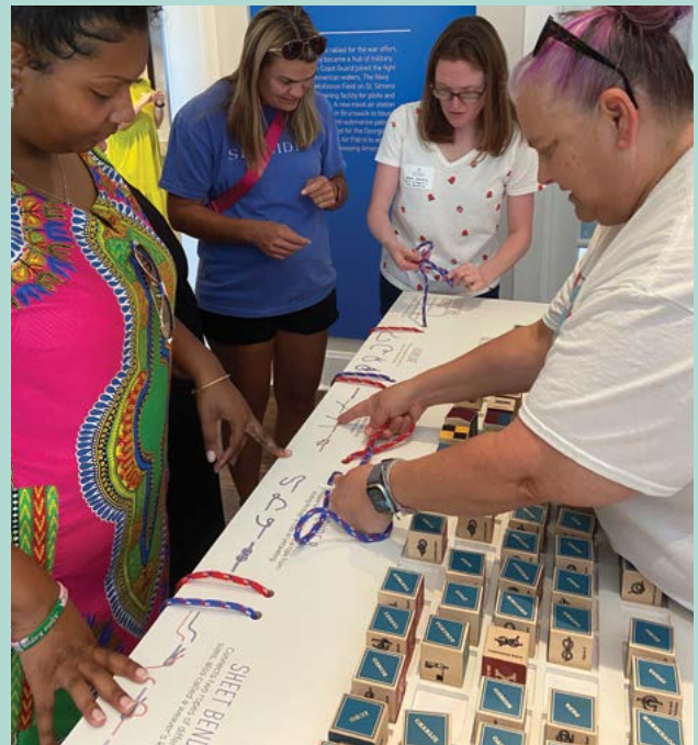
Teachers enjoy the knot tying activity at the Home Front Museum.