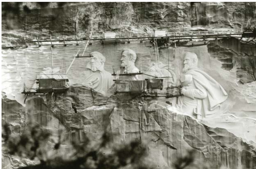
View of the 20th century carving at Stone Mountain in progress, undated.