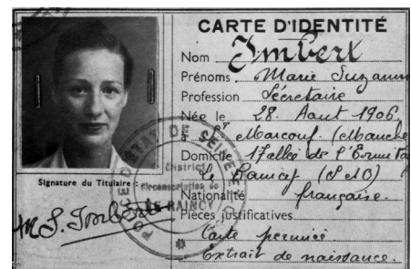
One of Marie-Madeleine Fourcade’s false identity cards.