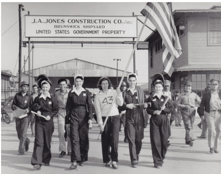
Shipyard employees, ca. 1943

In celebration of the fifth anniversary of our Home Front Museum, the Society will present four programs devoted to World War II topics. Our lectures will delve into the dramatically different wartime experiences in three nations — Britain, the United States, and France. The series will also examine one of the most significant and controversial achievements of the war, the development of the atomic bomb, as seen through the eyes of the brilliant scientist who headed the project. This series gives us the opportunity to invite back four exceptional speakers who presented popular programs in the past.