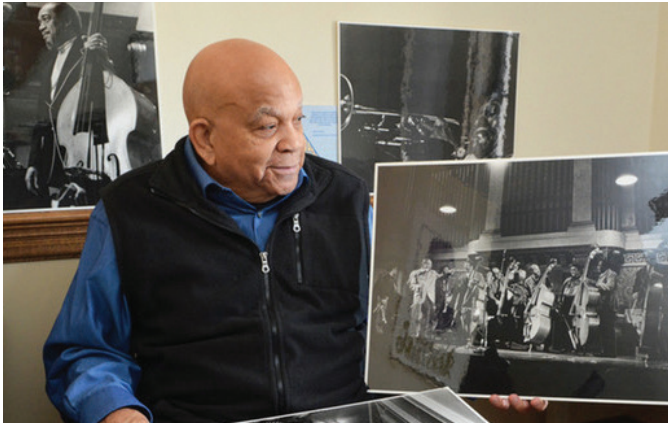
YaleNews, May 1, 2017.