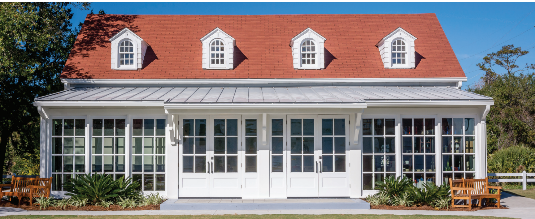
Rehabilitation of the original Boathouse, World War II Home Front Museum 2018