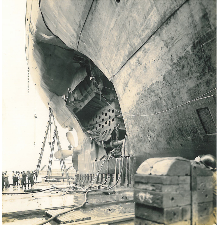
Torpedo damage on SS Oklahoma , attacked by U-123 on April 8, 1942.

This program is part of the Society's work to achieve our strategic initiatives of serving wider audiences and expanding our statewide impact through partnerships with other organization.