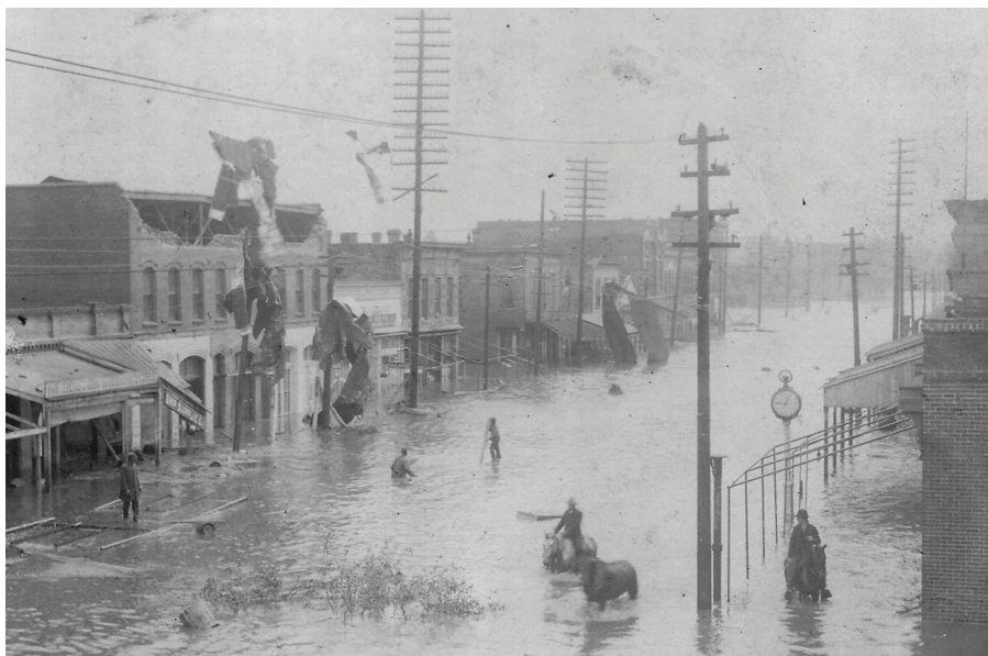
Hurricane of 1898, Downtown Brunswick

The cost for the pair of lectures is $35, and registration is required.