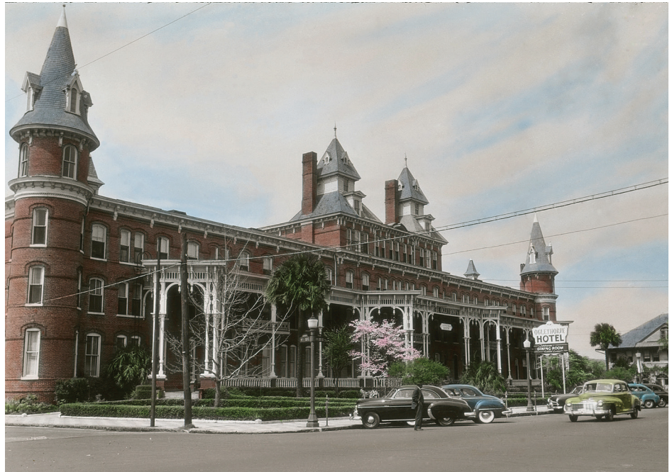
Oglethorpe Hotel, circa 1950

including the railroads and the port, saw their greatest growth in the late 19th century when the town became one of the leading producers and exporters of naval stores in the world. While the emphasis will be on economic history, the story of education in Brunswick will also be discussed, particularly that of African American schools established after the Civil War. For the 20th century, the lectures will cover Brunswick's important Home Front contributions during World War II with its major shipbuilding initiative, as well as the thriving commercial seafood industry that developed in Brunswick after the war. Dozens of historical images and Brunswick scenes will illustrate the city's rich history, making this a program not to be missed!