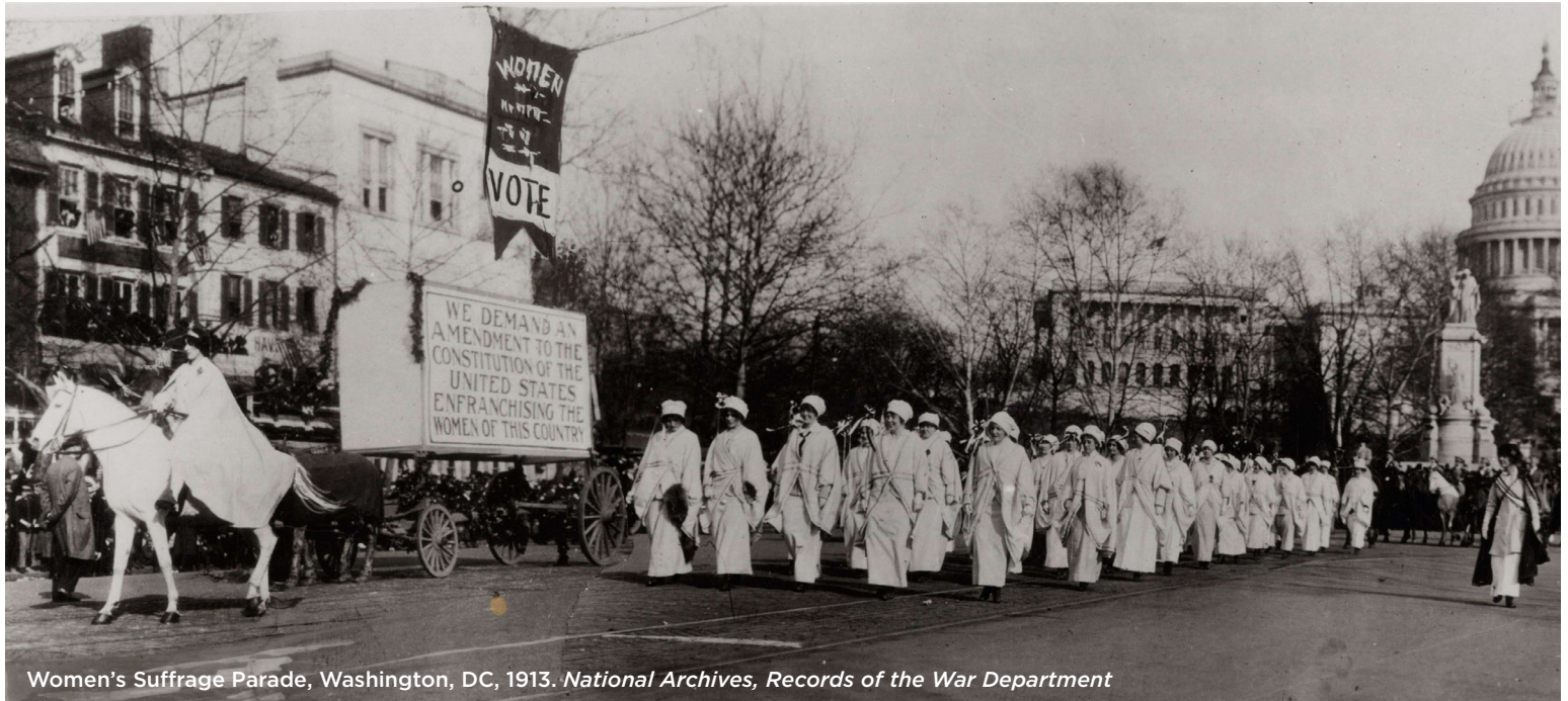
Women's Suffrage Parade, Washington, DC, 1913.

In honor of the 100th anniversary of 19th Amendment ratification, the Society will present a pop-up display and a program on women's suffrage. The display entitled "Rightfully Hers" will be on view at the Heritage Center starting mid-August. Provided by the National Archives in partnership with the Women's Suffrage Centennial Commission, it traces the history of the movement to expand voting rights to millions of women, including African Americans.