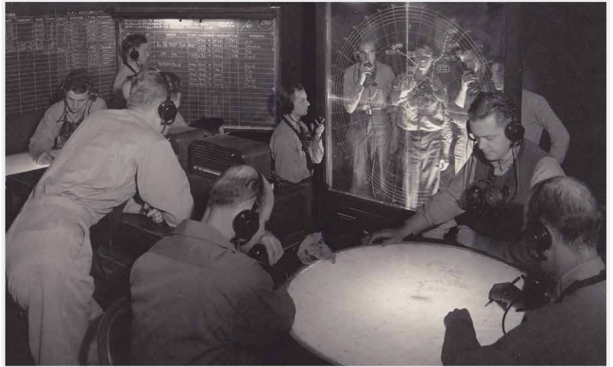
Simulation rooms, like this one at the King and Prince Hotel, were used to train Navy officers in fighter direction – the use of radar to direct pilots to intercept enemy aircraft.

Installation of exhibits has already begun and will be completed in early November. The design and development of the audiovisual elements and interactives are in the final stages. By mid-October, modifications to the historic buildings, along with the addition of detached restrooms, an education pavilion, and an archaeology dig area will be complete. Finishing touches, such as restoring the monumental flagpole and reinstating the Station's aerial identification marker, are in progress to create a completely refreshed and cohesive museum campus. Finally, during November, Sea Island Landscaping will beautify the site with the addition of landscaping and exterior signage – all in preparation for the Grand Opening on December 8.