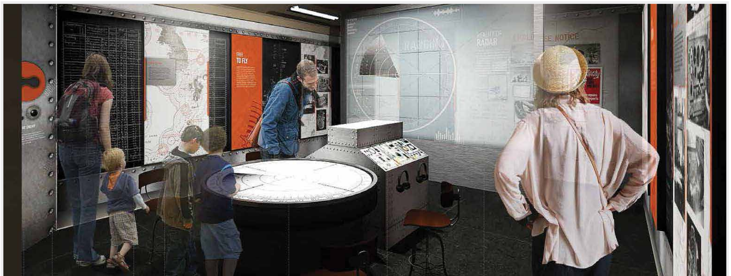
The Naval Air Station St. Simons gallery recreates the training simulation facilities on the base, and includes an interactive game where visitors see if they have what it takes to become a Fighter Director.

We invite members to preview the new Museum on Friday, December 7, between 11 a.m. and 3 p.m., before it opens to the general public on December 8.