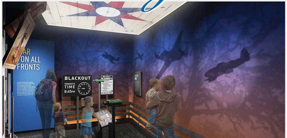
The War on All Fronts galleries will immerse visitors in the civilian experience in Coastal Georgia during WWII, including an interactive plane spotting game.

On December 8, the opening of the new World War II Home Front Museum will mark one of the most significant achievements in the Society's 53-year history. Thank you for your enthusiastic support and generosity which have made this ambitious project possible.